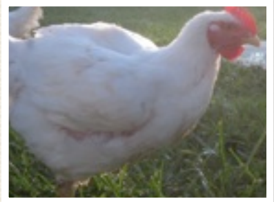
GMO-FREE PASTURED CHICKEN - $4/LB ORGANIC CHICKEN - $5.25/LB