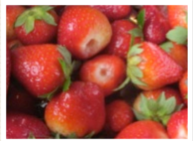
ORGANIC STRAWBERRIES, BLUEBERRIES, RASPBERRIES, PEACHES