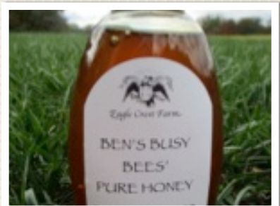
HONEY - $9/LB OR $40/5LB